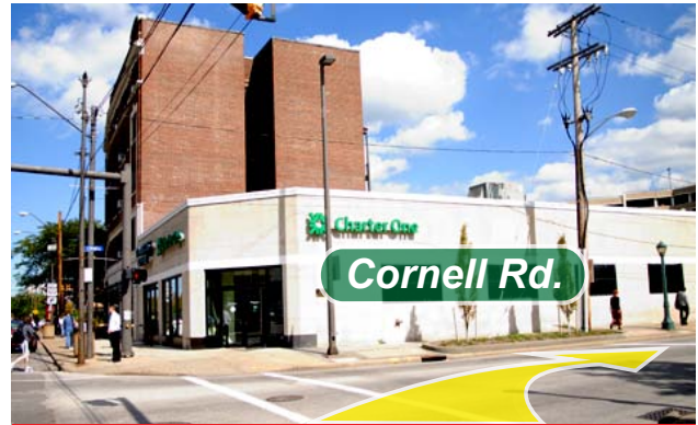
Right (south) on Cornell Road