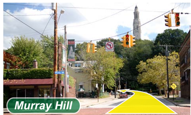
Cross Murray Hill, follow arrow up hill